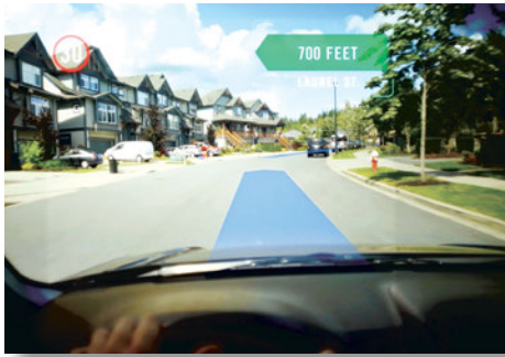
Access to HUD for Navigation