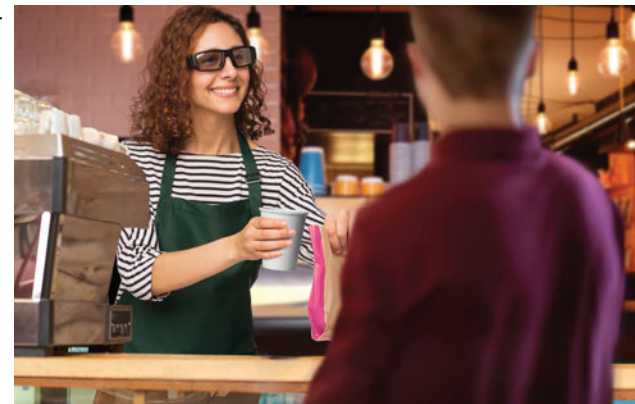
Enhancing service in retail through mobile hands-free access

The Vuzix Blade 3000 Smart Sunglasses are completely untethered, and support both wireless Wi-Fi and Bluetooth interfaces. They deliver a “hands free” digital world, providing unprecedented access to